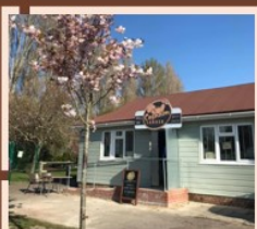
Find us in Cosham Park.

Tues Weds Thurs Opening Times 10am – 2pm